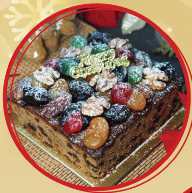
Christmas Fruit Cake

Sweeten up the merry season with classic holiday sweet treats! We have the perfect little treats to wrap up your Christmas feast.