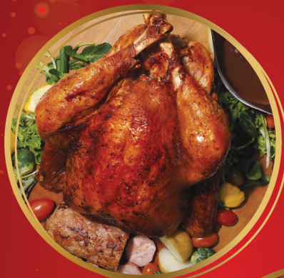
Roasted Whole Turkey

10% off meat orders with payment by credit card. T & C apply.