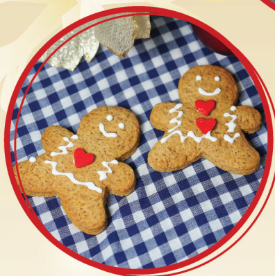
Ginger Bread Cookie