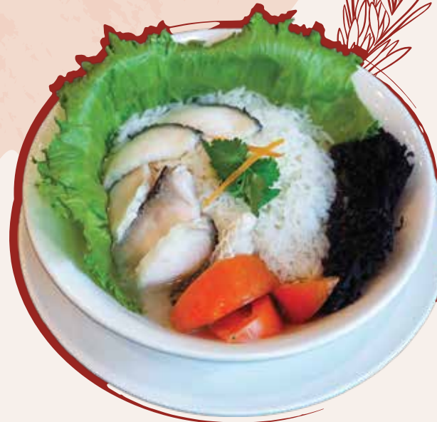
Teochew Fish Porridge