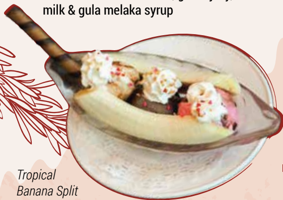
Tropical Banana Split