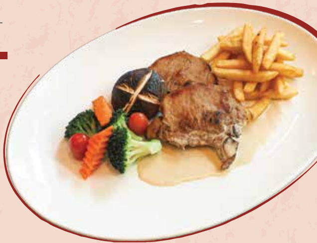
Pan-seared Pork Chop